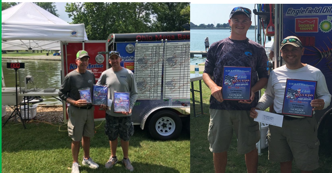
2018 Pro Open winners at Indian and Lake Erie