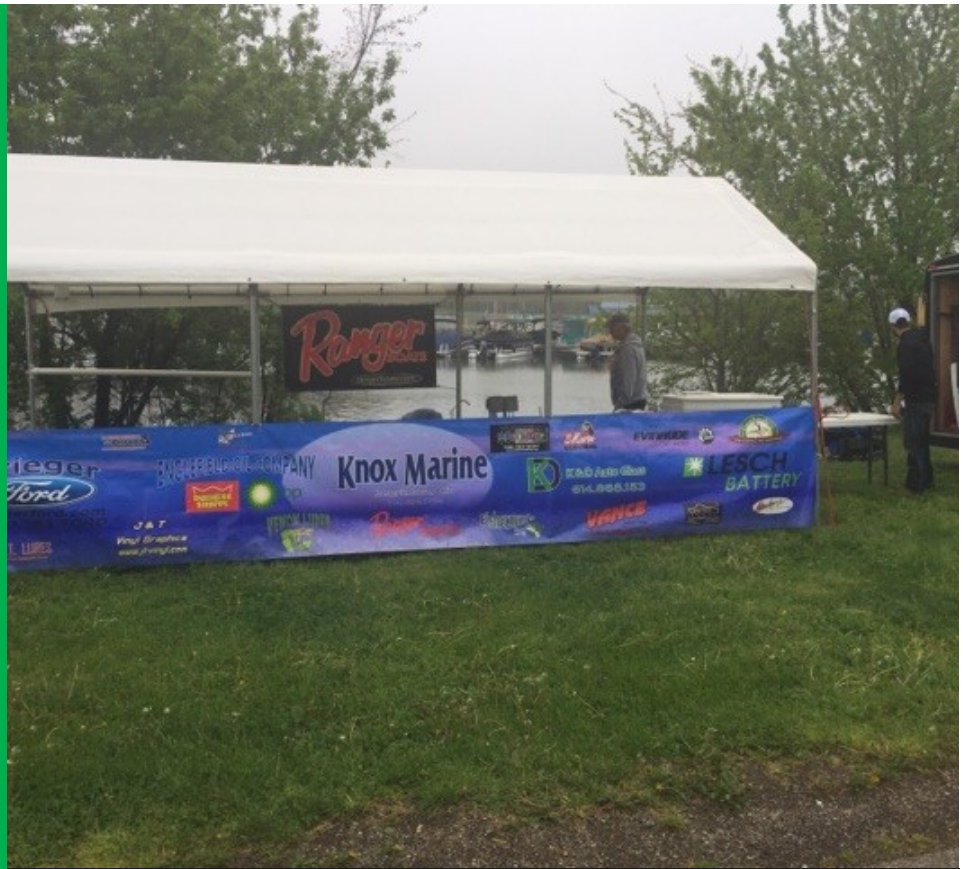
Set up at Pleasant Hill

Going on our second season now with KMTT we were so happy to see the huge interest in the trail. We did not anticipate filling the field in February but that seems to be the direction from here on out. If you have an interest in the trail be sure to pay your deposits early for 2019!